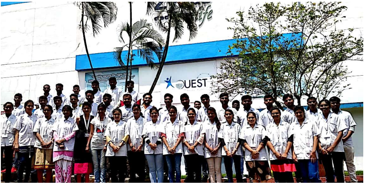
Diploma visit: Diploma visited Dr. VASANTRAO PAWAR MEDICAL AND RESEARCH CENTRE