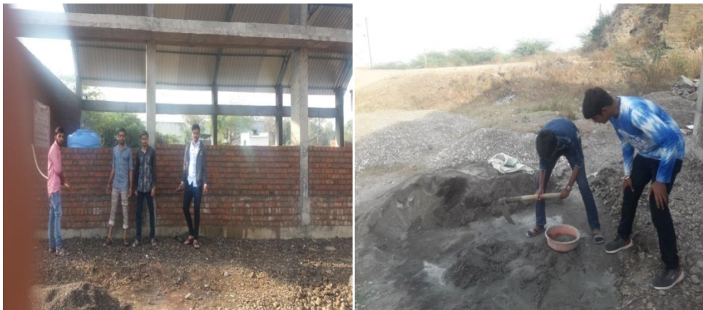
NSS VOLUNTEERS PLASTERING THE GRAM PANCHAYAT GYM.