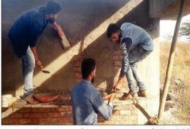
खानगाव थडी : व्यायाम शाळेला प्लास्टर करताना मातोश्री फार्मसीचे विद्यार्थी.