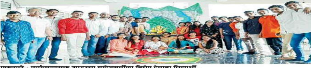
एकलहरे : पर्यावरणपूरक शाडूच्या गणेशमूर्तीला निरोप देताना विद्यार्थी.